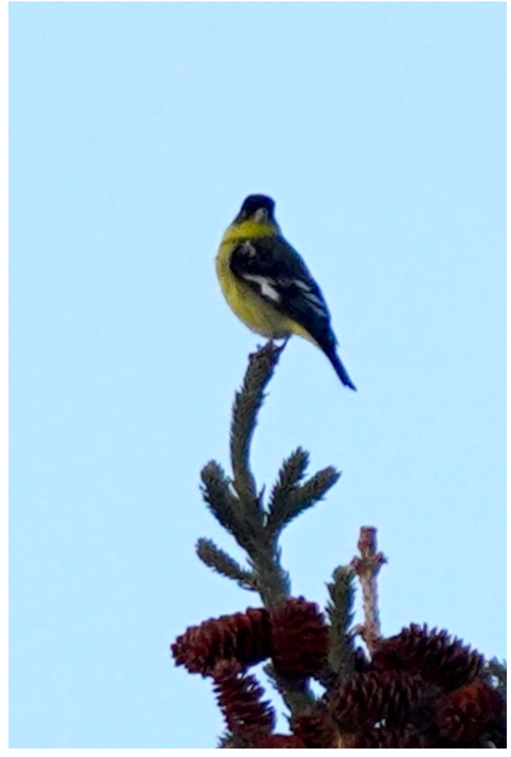
Top left: Lesser Goldfinch, November 13, 2022 Top right: Bobolink, November 13, 2022