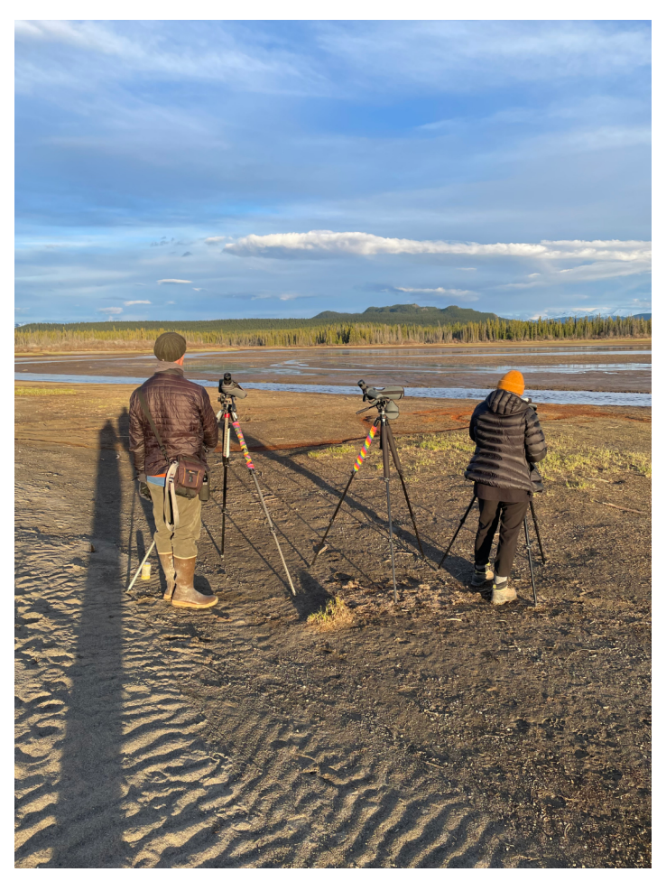
Overlooking the mouth of Judas Creek, Marsh Lake. Veteran Birdathon participants know big rewards lurk in Yukon wetlands where dozens of species of waterfowl and other waterbirds can be found in the spring. Spotting scopes are a big help in these wide-open spaces.