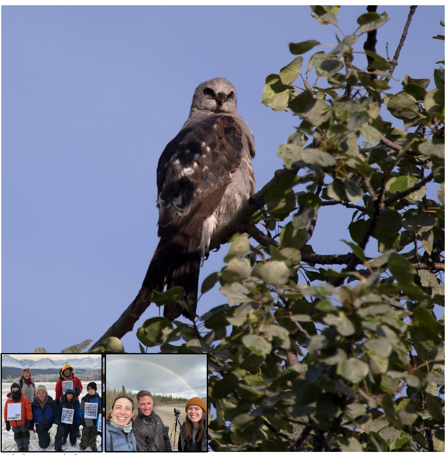
Christmas Bird Counts 2022