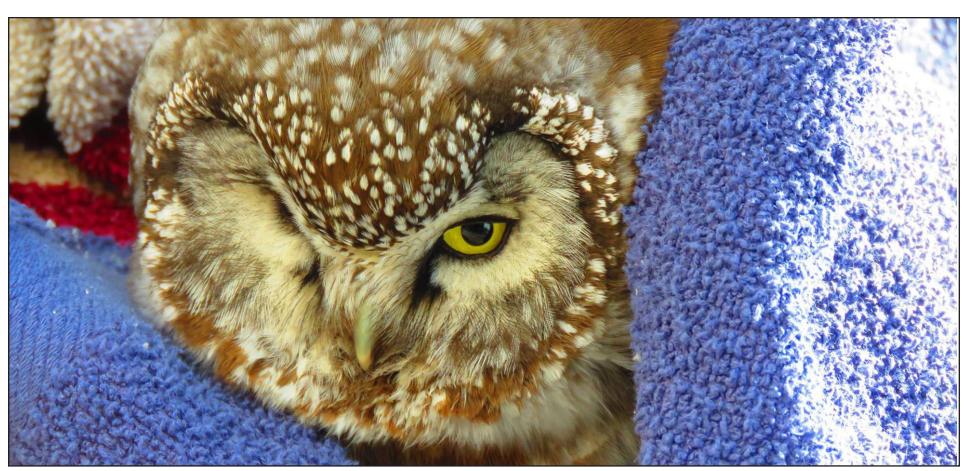
Boreal Owl survives window collision