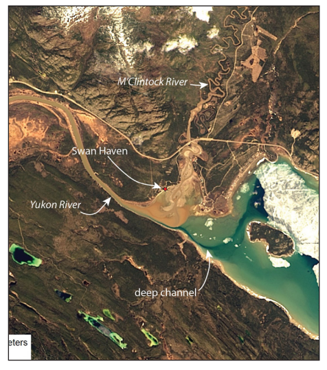
Lewes Marsh and the north end of Marsh Lake as seen from the Landsat 8 satellite on 27 May, 2013. A huge plume of muddy water is visible pouring out of the M'Clintock River in front of Swan Haven and flowing down the Yukon River.

The largest count of both species of swans at all three areas on a single date was 3,954 on 14 April, 2005. The largest count of Trumpeter Swans was 3,491 on 7 April 2010, and the largest count