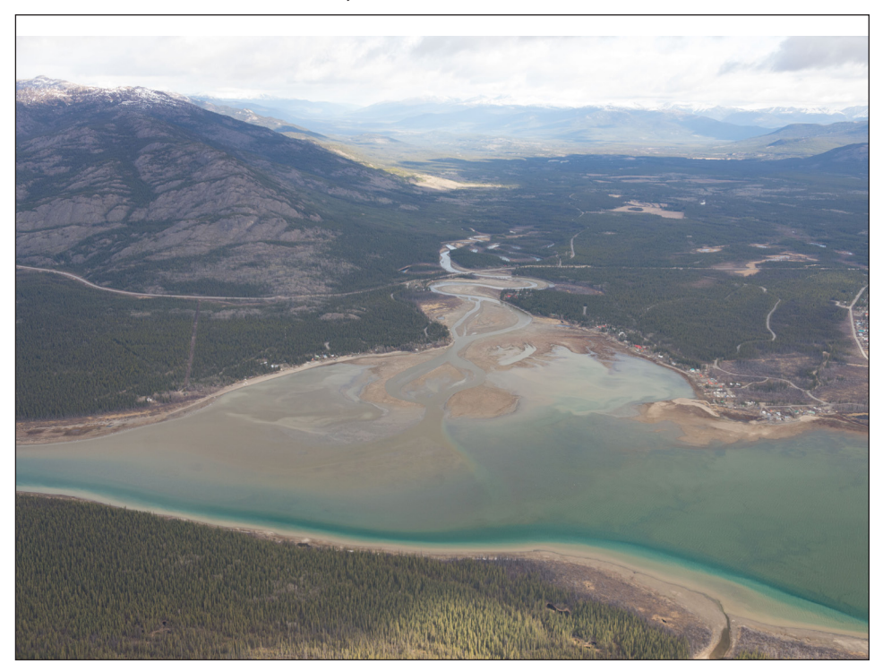
M'Clintock Bay from the air looking north on May 5, 2016.

What will this spring be like? We had a lot of cold weather and snow over spring. However things are getting much warmer and it could all turn around pretty fast! Get out there and find out for yourselves!