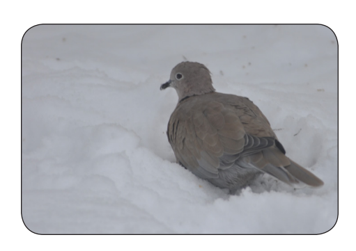
Ode to Dusty the dove