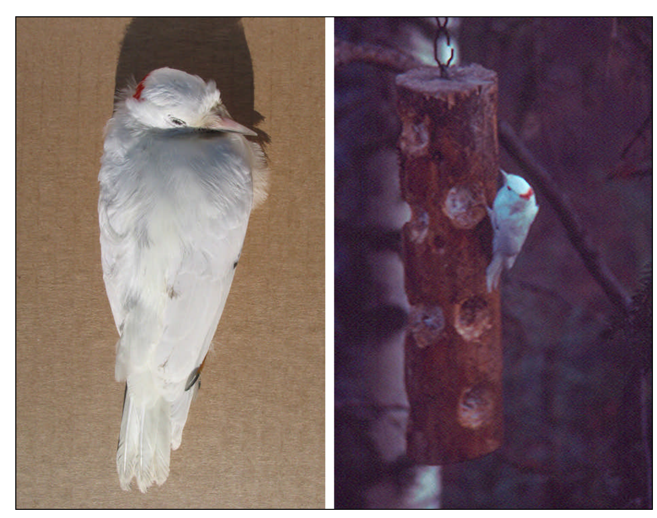
The leucistic male Downy Woodpecker: photos by Jim Hawkings (left) and Wolf Reidl (right).

and appear white. This Downy Woodpecker's dark eye, red nape patch, and black spotting on the wing showed that it had some pigmentation. Pure albinos are completely white with pink eyes, legs and bill. There are numerous Yukon records of other species showing albinism and leucism including Northern Pintail, Gadwall, Northern Shoveler, Herring Gull, Lesser Yellowlegs, Chipping Sparrow, Dark-eyed Junco, White-crowned Sparrow, Pine Grosbeak, and Common Redpoll.