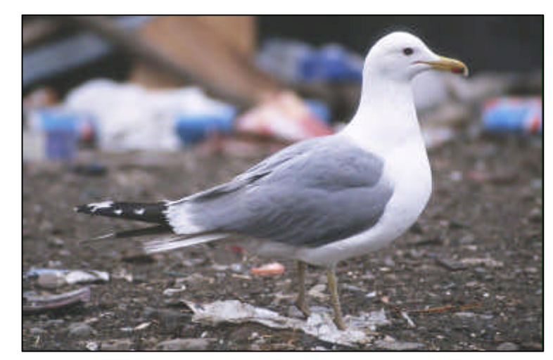
This adult California Gull on 1 June 2002 remained for four days when it was joined by a second adult.