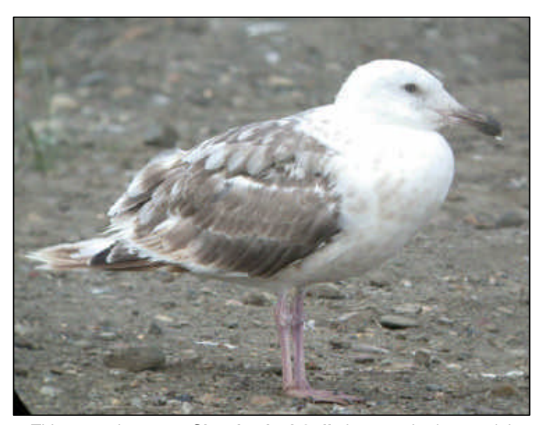
This second-summer Slaty-backed Gull photographed on 31 July 2002, was present through 8 August.