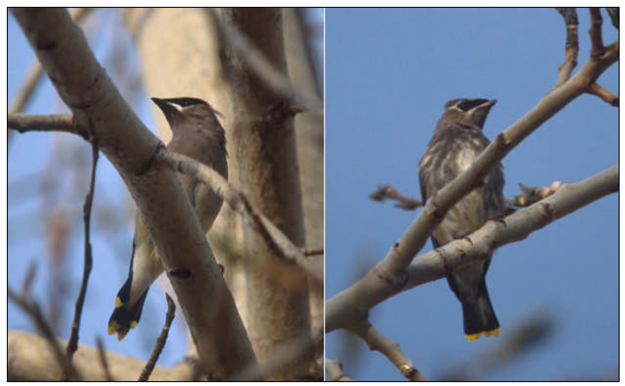
The occurrence of an adult (left) Cedar Waxwing with five juveniles (right) on 8-10 October 2002 in Whitehorse suggested a family group. Photographed here on 8 October by Cameron D. Eckert.

Varied Thrushes were on the move along the Teslin River with 18 tallied on 15-19 September (MG). An apparent family-group of 6 Cedar Waxwings (1 adult, 5 juveniles) in Whitehorse on 8-10 October were right on cue for a crowd of bird biologists in town for the Partner's in Flight meetings (m.ob.). That sighting combined with a summer observation of a single Cedar Waxwing in Whitehorse on 1 July (CE) suggested local breeding. This species is rare in the Yukon. The first migrant Lapland Longspurs reported was a flock of 80 in Whitehorse on 4 September (CE). A flock of 30 redpolls at Gravel Lake, central Yukon on 5 November included at least 15 Hoaries and five Commons (CE,PS).