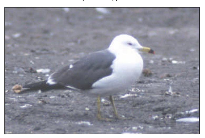
This sub-adult Black-tailed Gull on 4 June 2002 – a first for NWT and a remarkable find anywhere in North America