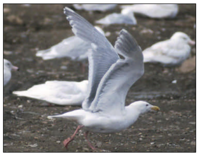
This adult Glaucous-winged Gull on 21 June 2002 was one of four seen from May through September.