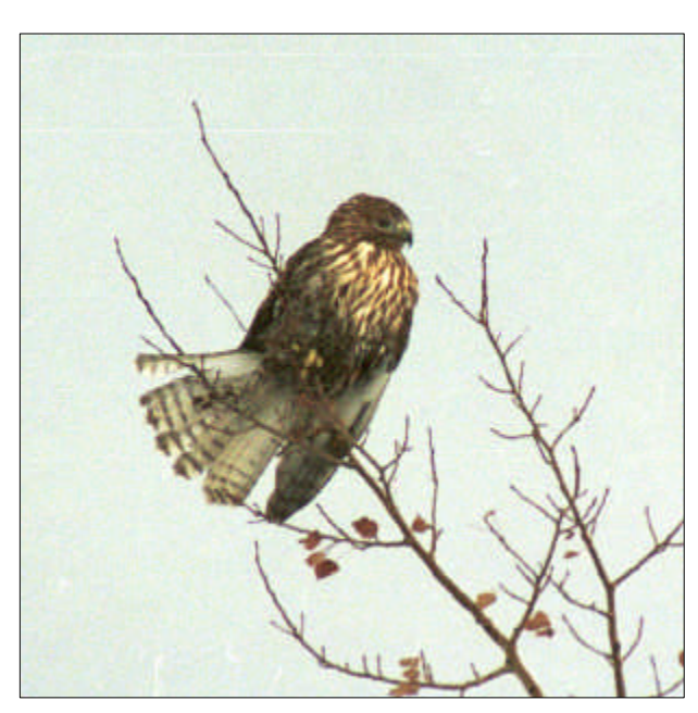
An immature Harlan's Red-tailed Hawk , a Yukon winter first, on the North Klondike Hwy near Burma Road on 24 December 2002.

An early male Northern Harrier was spotted in Whitehorse on 23 February (BB,RM). One could assume that this was a very early migrant (usually in April in the southern Yukon. It normally winters from northwestern B.C. south, actually not that far from the southern Yukon. A Red-tailed (Harlan's) Hawk was seen along the North Klondike Highway near Burma Road on 23 December (KO,CM). With the aid of photos, it was determined to be an immature dark-morph bird on 24 December (HG). This was the first winter record in the Yukon The Harlan's subspecies winters inland only, from southern Nebraska to Texas. Single immature Golden Eagles were seen at Rabbit's Foot Canyon in Whitehorse on 24 December (BD), at the Tagish dump on 3 January (BD,YS), and at the Takhini Hot Springs on 4 February (LC). The Golden Eagle is only casual in winter in the Yukon. It winters from central B.C. and northern Alberta south to Mexico. A Gyrfalcon , an interesting raptor at any time of the year, was seen at Mt. Decoli near Haines Junction on 26 December (BH,CH). The Gyrfalcon is one of few raptors that occur in the Yukon and other northern areas year-round.