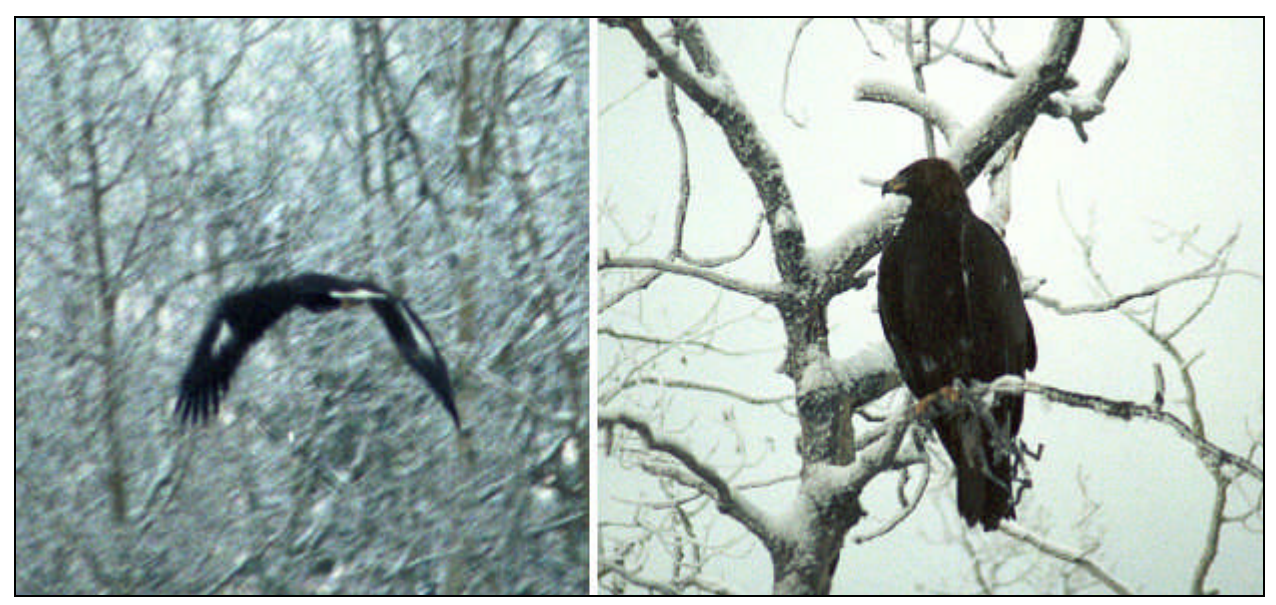
Two views of an immature Golden Eagle at the Tagish Dump on 3 January 2003.

the Pacific coast from Alaska (Aleutians) to Central America. A female Barrow's Goldeneye was seen on Lake Laberge on 7-12 December (BD,HG); another female (or the same?) was on the Yukon River near the Yukon River trail in Whitehorse on 26-31 December (JH,LHa,AH;HG,BD). The Barrow's Goldeneye is casual in winter in the Yukon. It winters along the Pacific coast from Alaska to central California.