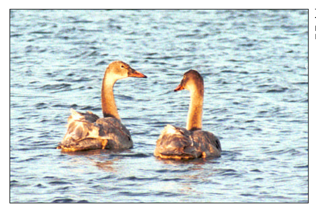
Two of the seven juvenile Trumpeter Swans at Lake Laberge in December 2002.

Although Mallards winter in small numbers at very few locations, this winter four males were seen on Lake Laberge on 1-16 December (BD,CE,HG), an unprecedented 102 were counted on the Teslin River at Johnson's Crossing on 3 December (HG), 12 were at McIntyre Creek wetlands on the Whitehorse CBC on 26 December, and up to 30 were counted there on 18 January to 22 February (HG). A domesticated-type male Mallard was joined by a female wild Mallard at the Takhini Hotsprings Pond in late fall and stayed throughout the winter (KH,BK,DK). A female-type Northern Pintail that didn't seem to be able to fly very well was seen at Jackfish Bay, Lake Laberge on 1 December (CE,HG). This was only the second winter record. Northern Pintails winter from central B.C. to Central America. A flock of up to 13 Lesser Scaup was noted on Lake Laberge on 1-24 December (BD,CE,HG); one male lingered at Carcross on 9-19 January (BD,HG, BeS). There had been only one previous winter record. Lesser Scaup winter from extreme southern B.C. to Central America. Up to 3 Long-tailed Ducks , were at Lake Laberge on 1-24 December (BD,CE,HG). This was the first winter record. They normally winter along the Pacific coast from Alaska (Aleutians) to central California. Up to 4 female or immature Bufflehead were seen near Carcross on 2 December to 9 January (BD,CE,HG). The Bufflehead is casual in winter. It winters along