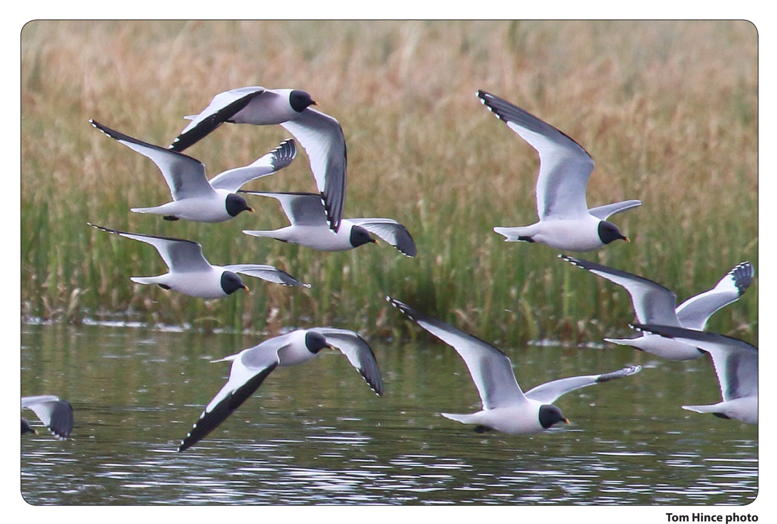
Sabine's Gull is a very rare interior migrant; this flock of 55 on Tthe Ndu Lake, s. Yukon on 3 June 2014 was a welcome surprise for a group of travelling birders.