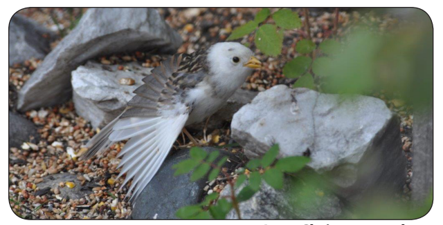
Leucistic (partial albino) White-crowned Sparrow.