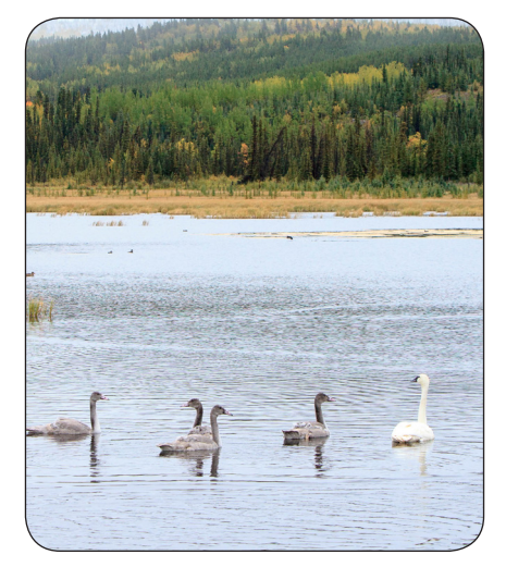
Trumpeter family sets up shop at Yukon Wildlife Preserve