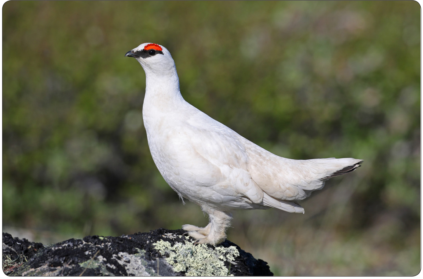
Male Rock Ptarmigan moult later in spring than Willow Ptarmigan, and so they dust bathe to improve camouflage. This male was still looking fairly bright on a snowless mountain top near Whitehorse on 25 May 2015.