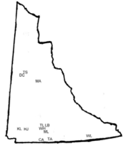
Figure 1. Locations of 2016 Yukon

This year's Audubon designated unusual sightings were: Bufflehead (2 – Carcross, 1 – Whitehorse), Common Goldeneye (5 – Tagish), Glaucous Gull (1 – Whitehorse), American Crow (2 – Watson Lake), American Robin (1 – Carcross), Fox Sparrow (2 – Haines Junction), White-crowned Sparrow (1 – Haines Junction, 1 – Takhini – Lake Laberge), Dark-eyed Junco (3 – Haines Junction), Snow Bunting (3 – Carcross).