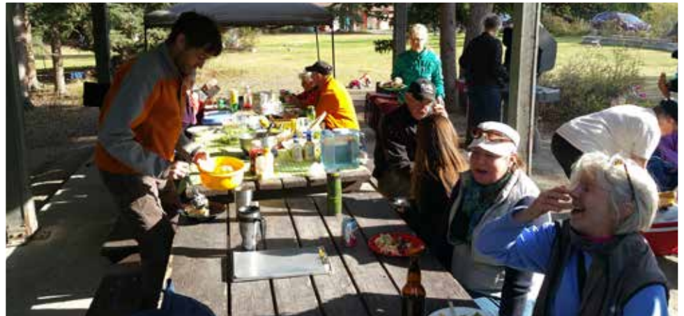
2017 Helmut Grünberg Yukon Birdathon